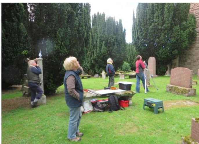
Is it a bird or a plane? Or... where has the red laser dot from the distance metre gone? Standing building survey at Kiltearn Old Kirk.

We would welcome any volunteers who would like to help with the website, checking out and suggesting links or helping to compile events. Similarly we would like to expand our Facebook postings. If you have a picture to share, maybe of an enigmatic object or site, please send it to us (ensure it is your copyright please), and we'll post it.